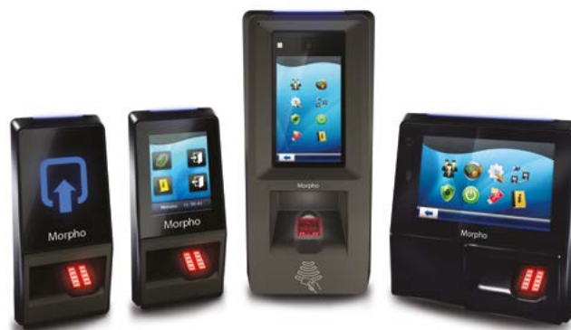
THE SIGMA FAMILY